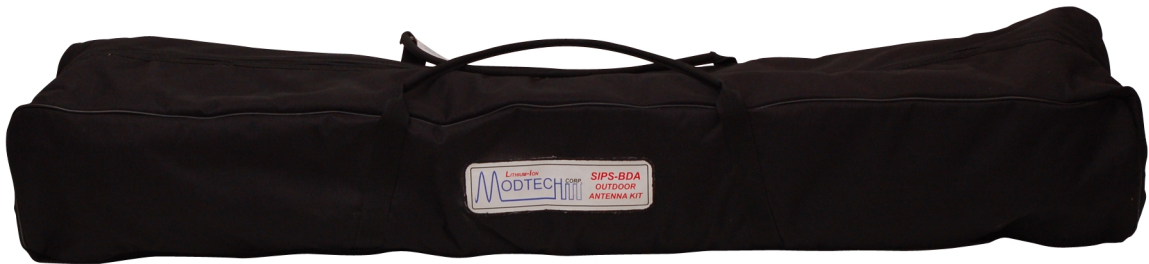
Figure 3 – Portable outdoor antenna kit

Figure 3 shows the outdoor antenna kit. The indoor antenna kit may be seen in figure 4. When called to an event at a participating building, the amplifier section of the indoor antenna kit is connected to the IBC Interface Box as shown in figure 5. Making this connection is fast and foolproof (connectors are polarized).