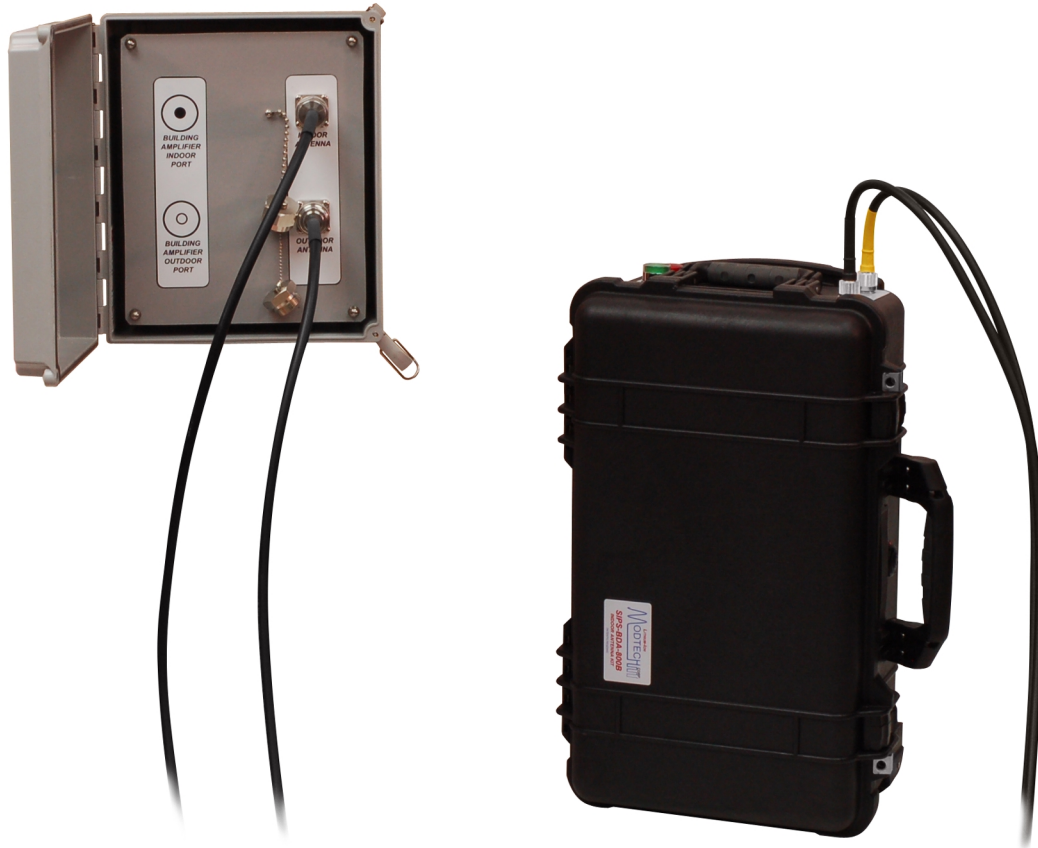
Figure 5 – Portable amplifier connected to IBC Interface Box using two heavy-duty coaxial cables. (B amplifier kit shown. Current proposal is to supply C amplifier as depicted in figure 4. A, B, D, or E amplifier kits may be substituted if possible / necessary).

As stated earlier, an important advantage of the hybrid approach (using fixed building antenna system in conjunction with portable, rapidly deployable, radio electronics) is the backup function provided by the portable kits. In the event of any problem, destruction, or malfunction of either building or radio tower equipment, the portable antenna system may be quickly deployed and aimed at any operating radio tower. Thus the FD maintains a building / tower independent approach to in-building communications. The fully deployed, portable configuration is shown in figure 6.