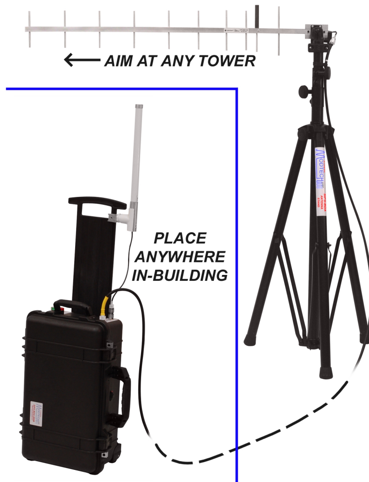
Figure 6 – Full, portable system deployment, independent of building equipment, can be aimed at any operating radio tower.