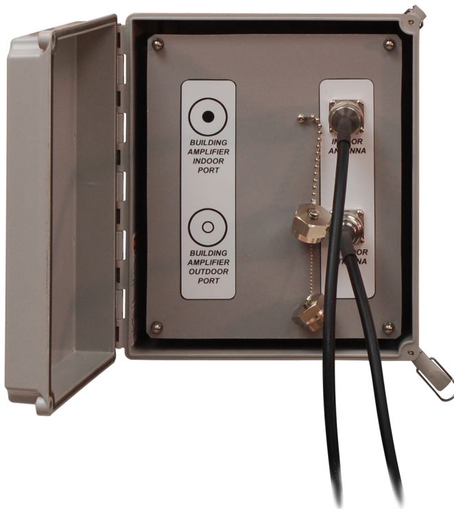
Figure 2b – In-Building Communications (IBC) Interface Box (cables attached)