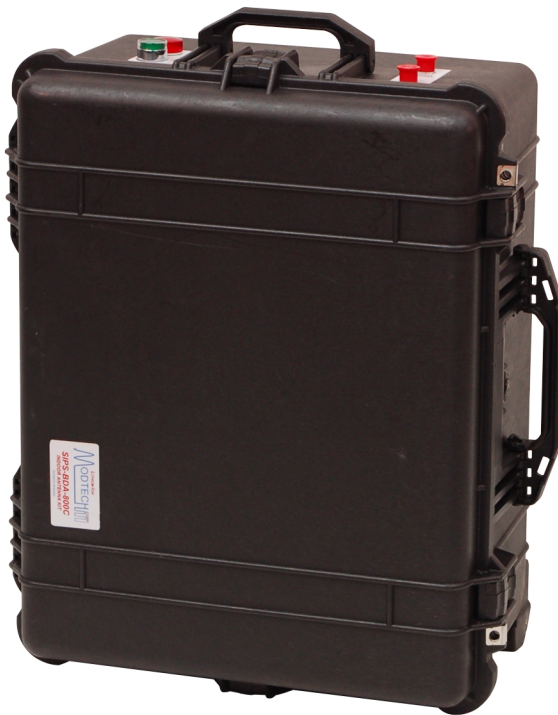
Figure 4 – Portable Indoor antenna and amplifier