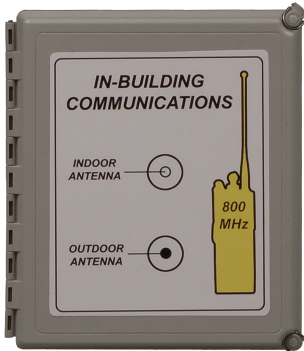
Figure 2a – In-Building Communications (IBC) Interface Box (closed)